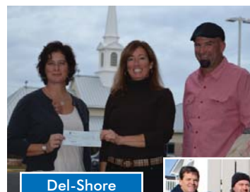
Del-Shore Design & Build