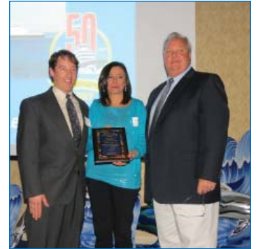
Cape May Lewes Ferry