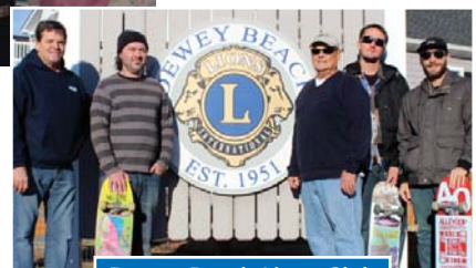
Dewey Beach Lions Club