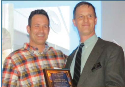
Dogfish Head Brewings & Eats