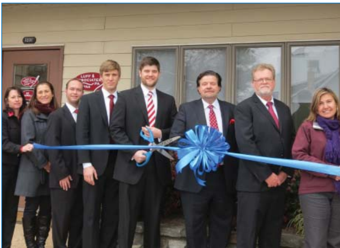
Luff & Associates, CPAs