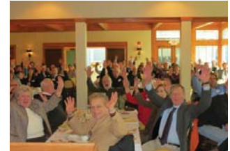
Members having fun!