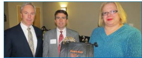
Event Sponsor - Discover Bank