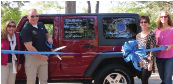
ABI Security Group, Inc.