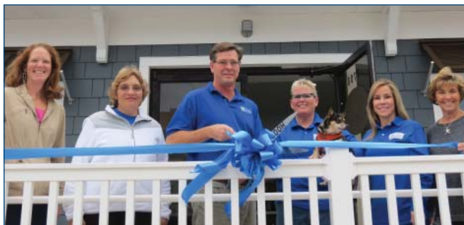
Dawn Patrol Café