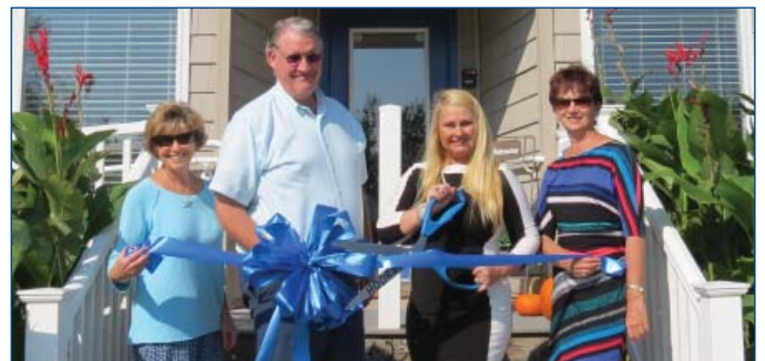
Acopia Home Loans