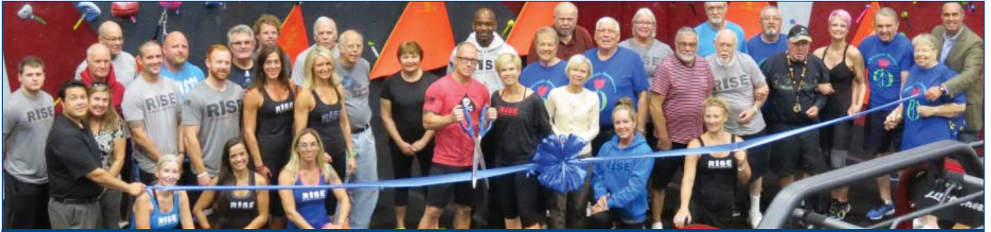
RISE Fitness + Adventure