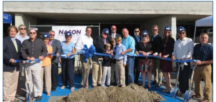
Lighthouse Cove Ground Breaking